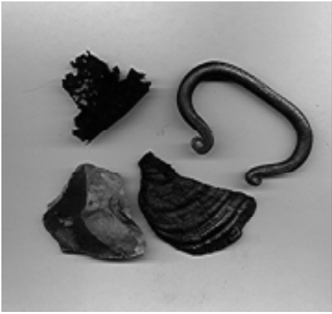
Modern Technology (clockwise from upper left): charcloth, iron, a charred polypore, and flint

pering color chart for steel). These sparks fall and embed in the fungus-char. Another way is to lay the char on the ground and hold the flint very close to the char. At first it is imperceptible that a spark has taken hold of the touchwood. A tiny white fleck will appear. You need do nothing to inspire it. It will begin to draft (draw) oxygen through the myriad chimneys formed by the polypore and gradually crawl through the char. The black chimneys whiten, with a subtle fiery glow underlying the ash... What a thrill to see the coal begin to breathe! Draft is crucial. Imagine sucking air through a garden hose in contrast to a soda straw: the smaller the tube, the more restricted the flow or draft of oxygen. The smaller the diameter of the pores, the tighter the draft and the slower it burns. More growth layers also lengthen the life of the coal, by slowing draft as a damper does in a chimney flue. Pore size will differ in species. 3 Annuals have usually one soft layer. Perennials have several rigid layers and are the better choice for char. Other tinder is nested around it to build the fire. Shredded cedar bark or teased hemp twine ignites easily, then add kindling. A fun-